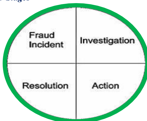
Exhibit-2. Four Stages