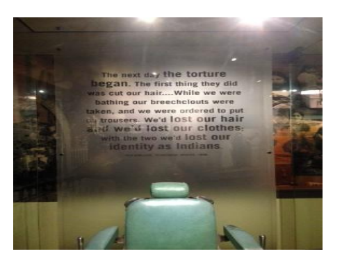
Fig. 2 - The Barber Chair The School Rooms