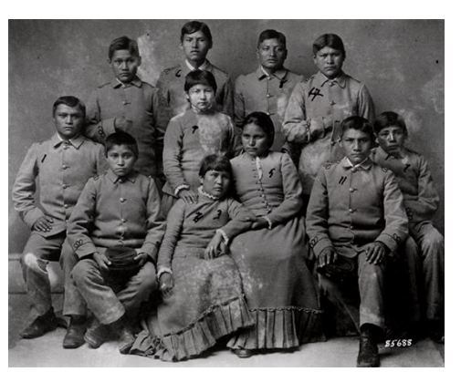
Fig. 6. Chiricahua Apache children upon arrival at Fig. 7. Chiricahua Apache children four months after their arrival at Carlisle Indian Industrial School.

The purpose of these selected images is to suggest to visitors that the removal of children and teens from the reservation and relocating them to an off-reservation boarding school was torture because it forced enculturation and assimilation in the greater American society. The visitor is repeatedly bombarded by like sentiment that strongly argues that the Indian Boarding Schools movement was designed not to better the Indian, but rather to solve the Indian problem.<sup>37</sup>