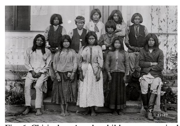
Carlisle Indian Industrial School from Fort Marion, Florida.

Upon first inspection, the exhibit overwhelms the senses. The sheer volume of photographs, the size, and the placement of the photos impresses the visitor with the magnitude of the project. The photographs were carefully selected for their specific persuasive ability to convey one or more "thematic" elements tied to the overall experience. The emotional pull generated by the sound of the barber sheers, the student narrated recording of having an "American haircut," and the image of a school worker attempting to communicate to a young girl dressed in native clothing illustrate the difficulty these native children had in overcoming language and cultural barriers. Furthermore, the images of children transformed as they underwent the social changes are illustrated below: