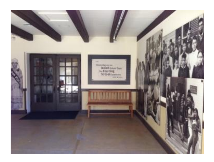
Fig. 1 – Entrance to the Boarding School Experience This narrative creates a "framing" of the exhibit, similar in the way that a book encapsulates the story with a clearly defined beginning, middle, and end. In addition to the photography on the entrance walls, the visitor is greeted with the sounds of the Native American experience.

Native American recordings are included throughout the exhibit and at the entrance, the voices of Indians chanting as they dance in rhythmic succession fills the air to set the tone and the mood.